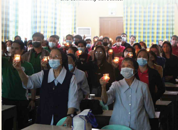
Pledge of Commitment ceremony in Philippines for Sisters and community advocates.

18000 West Nine Mile Road, Suite 550 Southfield, MI 48075-3734 USA