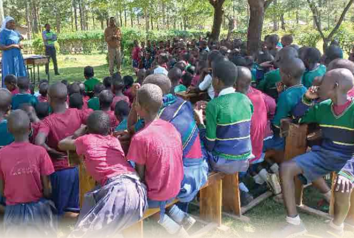
Education provided to children in Tanzania about the dangers of trafficking.