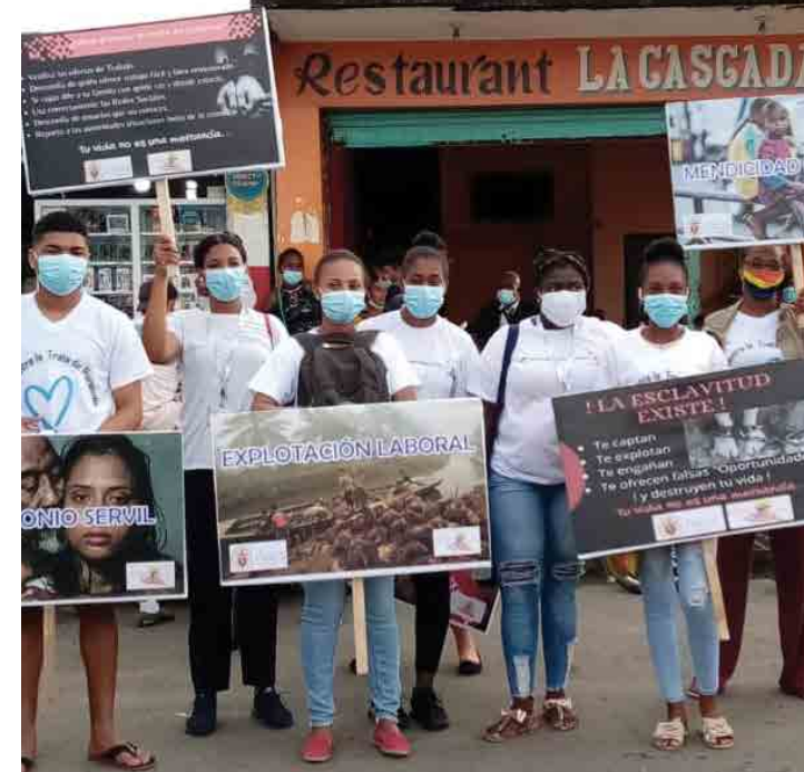
Photo: Advocacy and Awareness Campaign in Venezuela