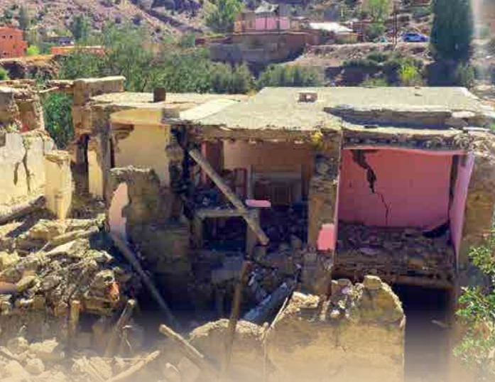
Earthquake in Morocco