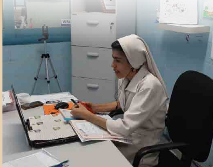
Telehealth during COVID - Brazil

18000 West Nine Mile Road, Suite 550 Southfield, MI 48075-3734 USA